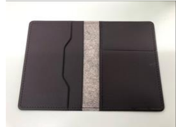
Business card holder