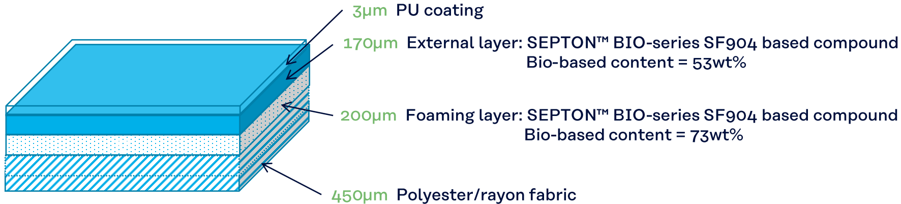
Structure of artificial leather C